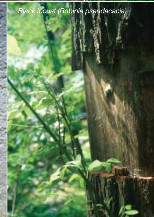
Black locust ( Robinia pseudacacia )