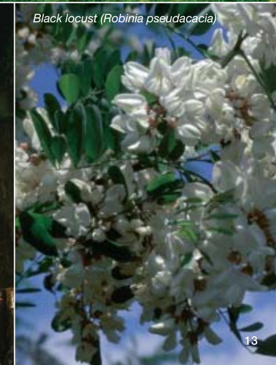
Black locust ( Robinia pseudacacia )