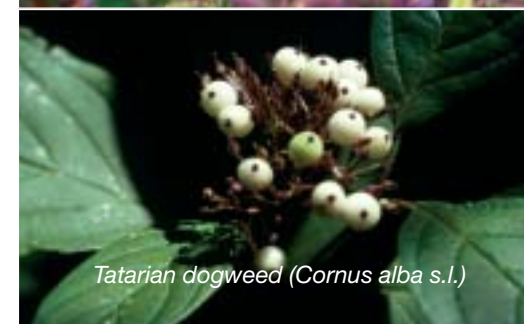
Tatarian dogweed ( Cornus alba s.l.)