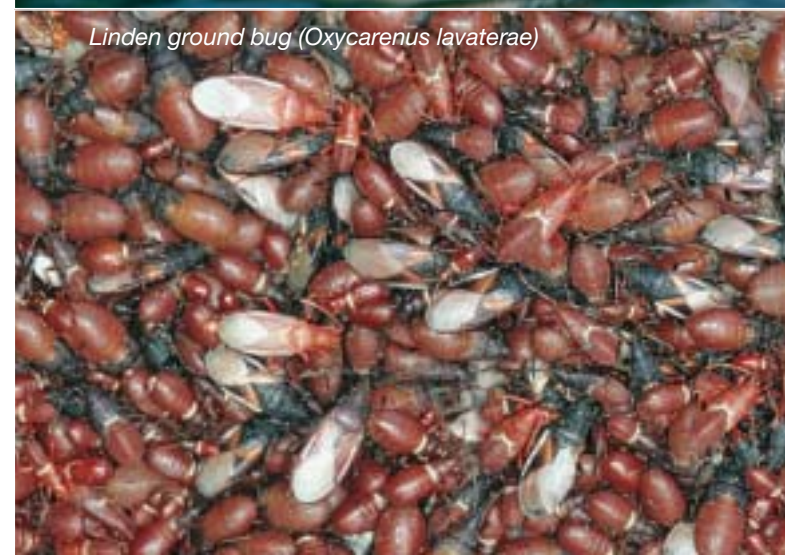
Linden ground bug ( Oxycarenus lavaterae )