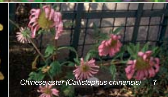
Chinese aster ( Callistephus chinensis )