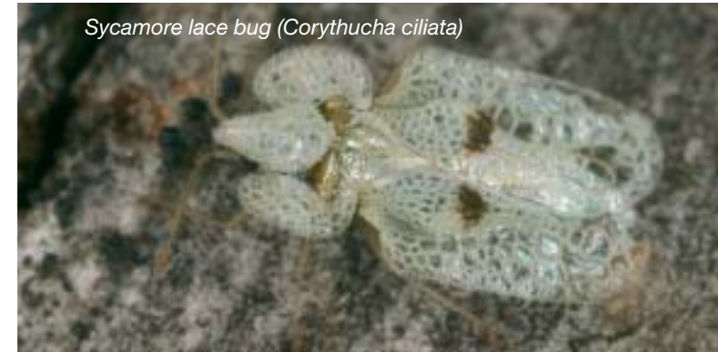
Sycamore lace bug ( Corythucha ciliata )