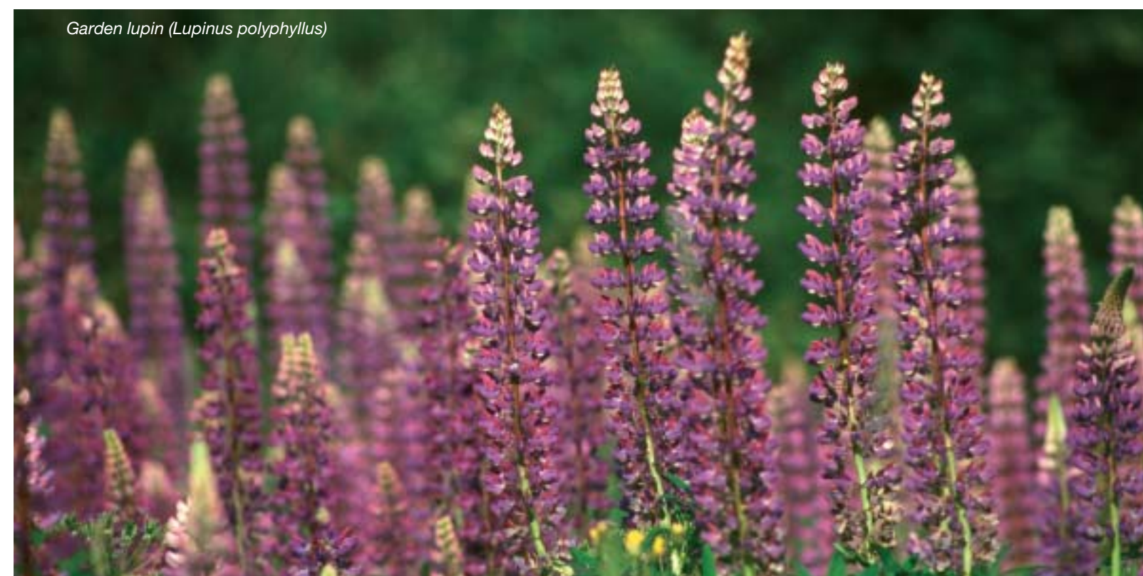
Garden lupin ( Lupinus polyphyllus )

Although the adverse economic impacts and health consequences of alien species have received rising attention over the past few years, hardly any reliable data have been compiled so far. However, the few estimations and calculations of costs available for individual countries demonstrate the high economic importance of alien species (MACK et al. 2000; PIMENTEL 2002). Except for the study of REINHARDT et al. (2003), comprehensive financial impact analyses are almost completely lacking for Central Europe.