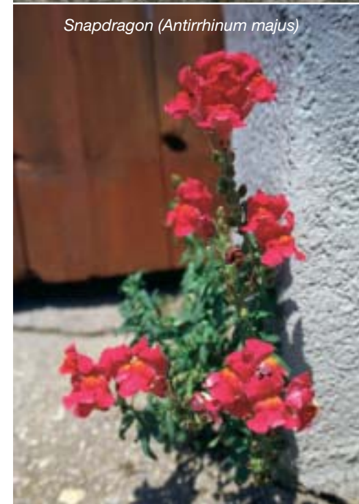
Snapdragon ( Antirrhinum majus )