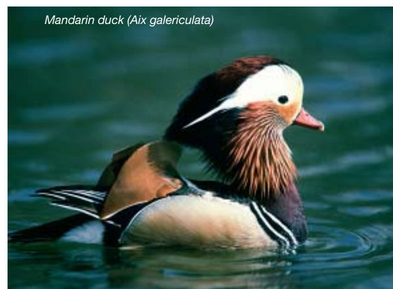
Mandarin duck ( Aix galericulata )