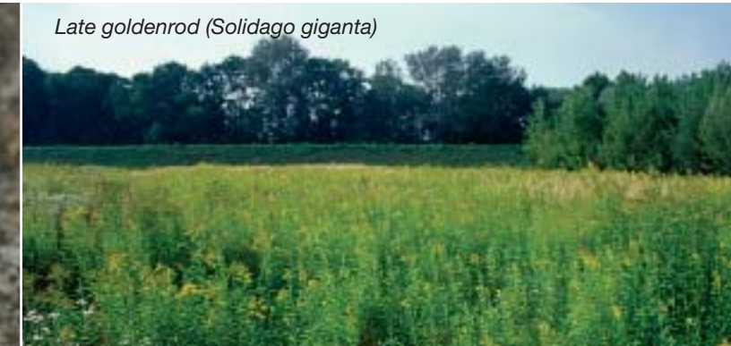
Late goldenrod ( Solidago gigantea )