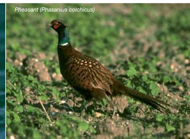
Pheasant ( Phasianus colchicus )