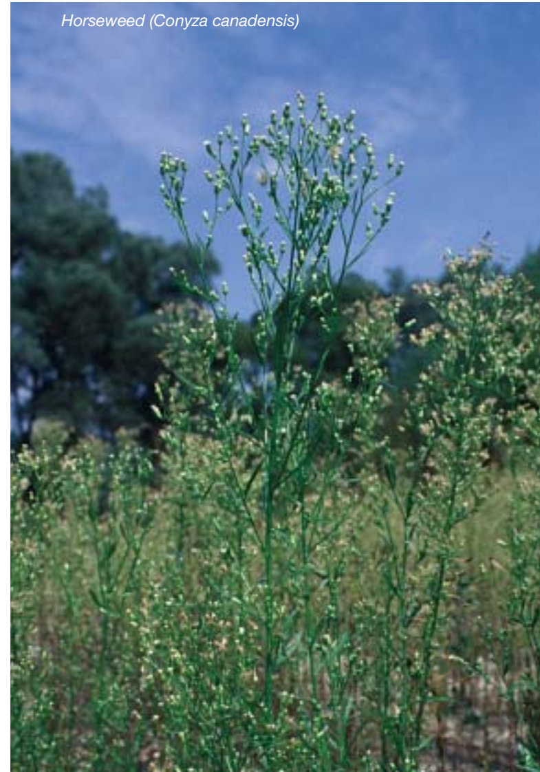
Horseweed ( Conyza canadensis )